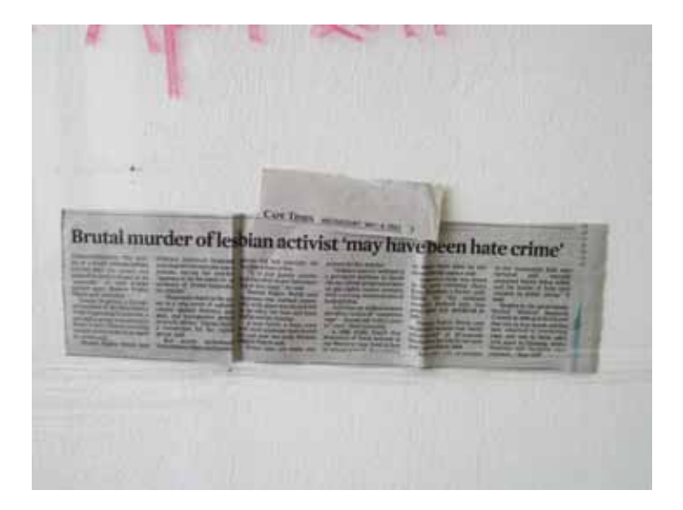
12 Zanele Muholi Isilumo siyaluma (2006–2011) Installation detail, Blank Projects, Cape Town 2011 PHOTO: RAÉL JERO SALLEY

13 Zanele Muholi Isilumo siyaluma (2006–2011) Wallpaper Installation view, Blank Projects, Cape Town 2011 PHOTO: RAÉL JERO SALLEY